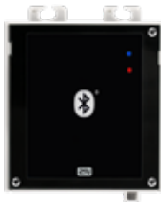
2N® ACCESS UNIT BLUETOOTH

ord. 916009 (125kHz) ord. 916010 (13.56MHz)