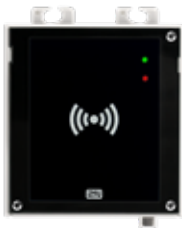
2N® ACCESS UNIT RFID

ord. 916009 (125kHz) ord. 916010 (13.56MHz)