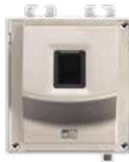
2N® ACCESS UNIT FINGERPRINT READER