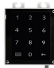
2N® ACCESS UNIT TOUCH KEYPAD